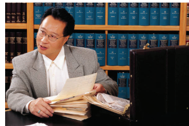
Lawyer Referral Service 1-800-268-8326